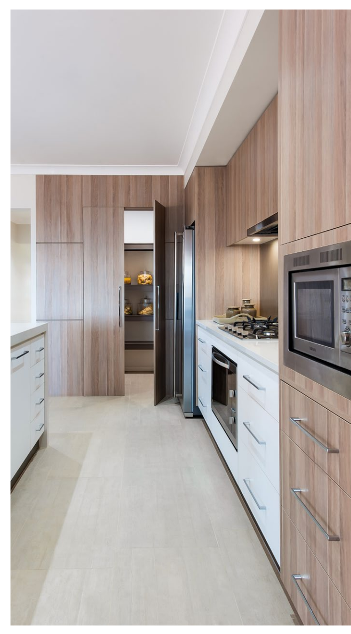
Touchtex ZeroLine: Ptarmigans Wing Matt Touchtex ZeroLine: Rumskulla Oak Matt